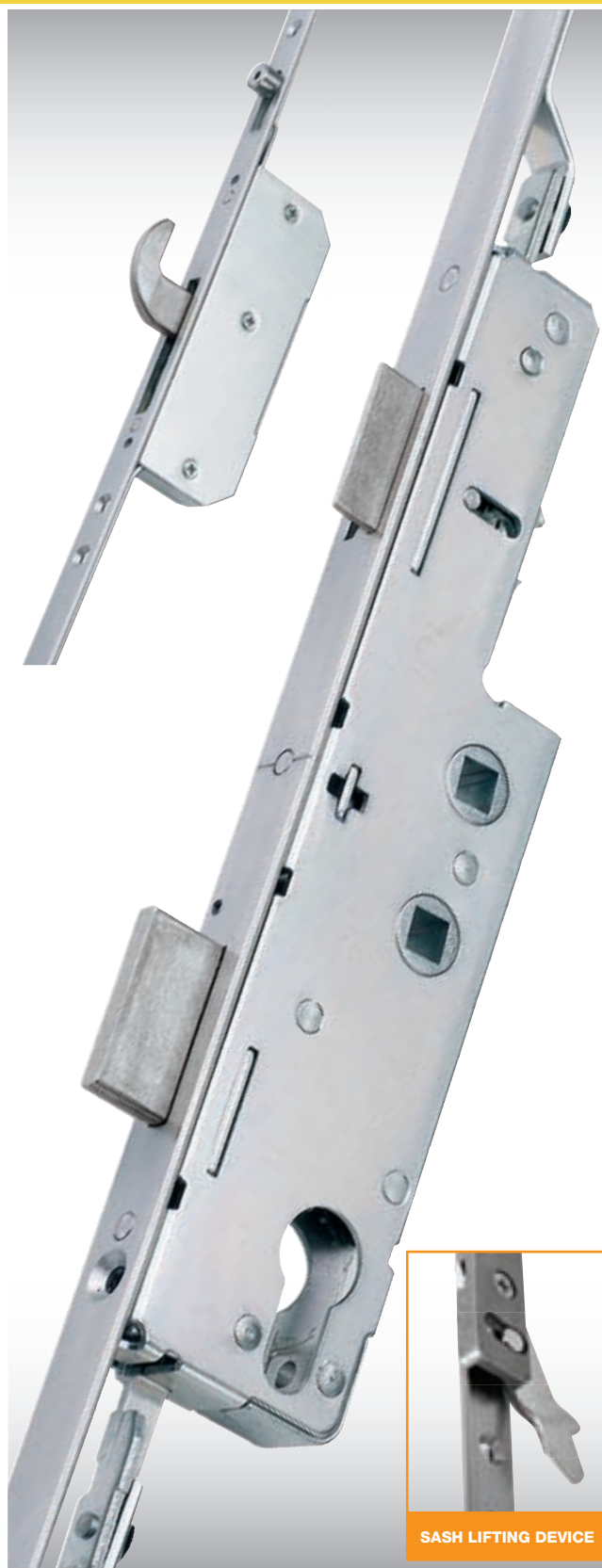
SASH LIFTING DEVICE